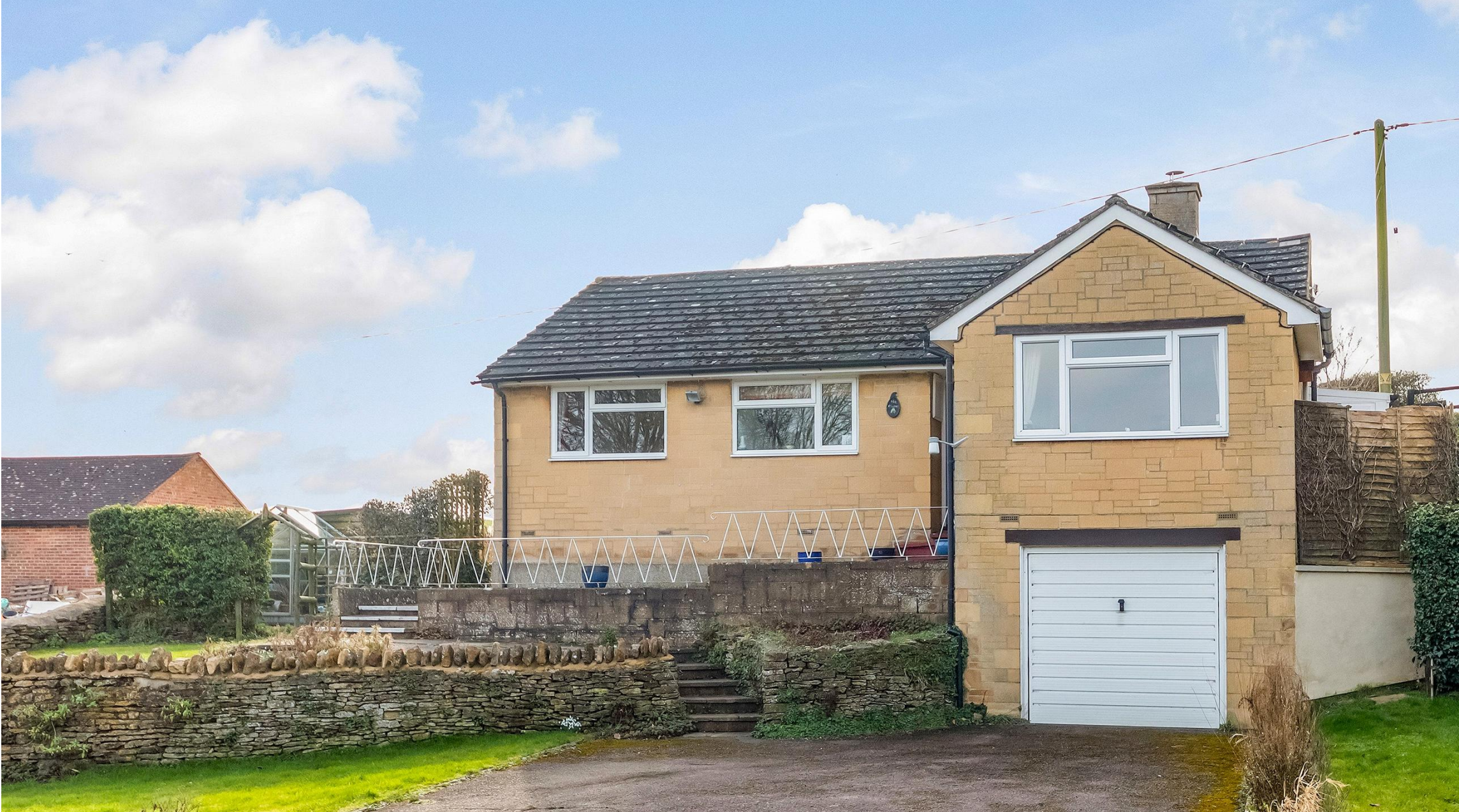
The Willows, Main Road, Upper Tadmarton Banbury, Oxon, OX15 5SL